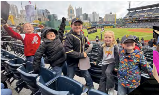
Above: All the kids had a blast.