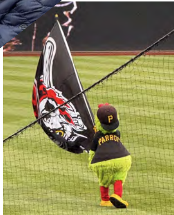
Right: The Pirate Parrot waves the Jolly Roger flag.