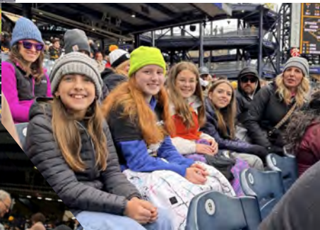
Above & Left: Everyone is all smiles even in the cold.